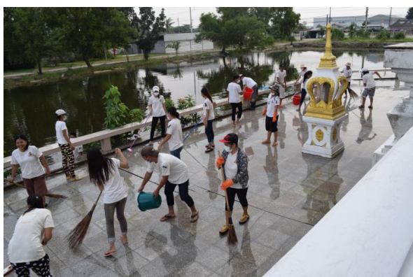
Cleaning day at Suneo Satthathum Temple

For a full list of community and charitable initiatives, and more details on Sustainable Luxury Vision 2020, please visit our Corporate Sustainability website at http://www.hshgroup.com/en/sustainable-luxury