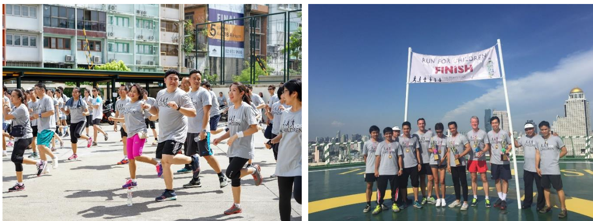
Run for Children, Bangkok