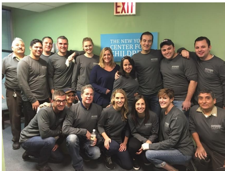
The New York Center for Children