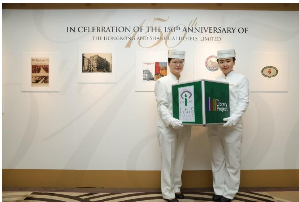
A new library is donated to The Library Project, Shanghai

<Photo release #4 – Worldwide Community Efforts>