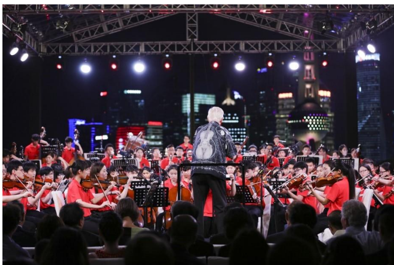
Asian Youth Orchestra

The community efforts will continue in other HSH properties around the world: