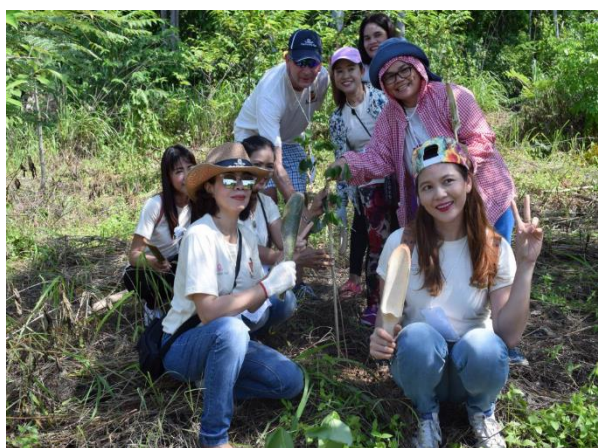
1500 Trees Planting with The National Forest Management Center at 229